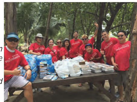
Wells Fargo Volunteers

It's so nice to see children from different homes across the island playing together and feeling so loved. – Resource Caregiver