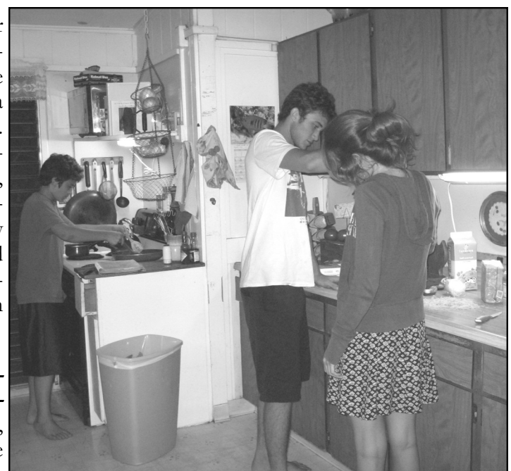
Preparing family meals can help youth build resilience

Growing up, many of the responsibilities and chores for upkeep of