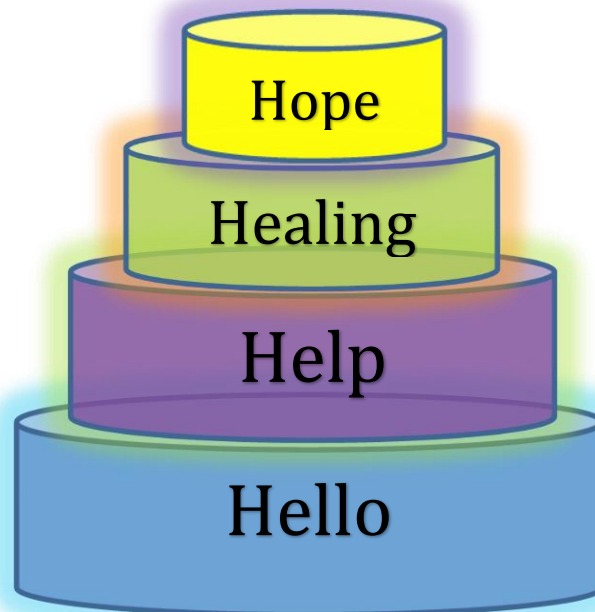
Family Focused Stages

But just as hello isn't something that only happens at the outset of the arc of care, hope isn't confined to the closing moments. Hello should kindle and nurture hope throughout the course of the process. Help should be delivered in the context of a powerful optimism designed to increase expectancy on the part of all team members as well as families. Healing should be recognized throughout the entire process of Wraparound as a way to acknowledge and celebrate gains and set the stage for a future of possibilities.