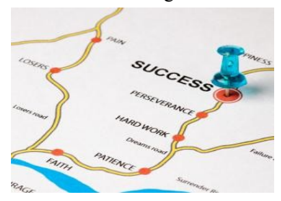
Create your own roadmap to a life that includes happiness, good health & meaningful work.

Undergraduate schools are four-year colleges that award bachelor's degrees.