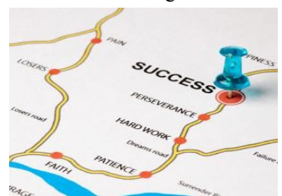
Create your own roadmap to a life that includes happiness, good health & meaningful work.

Undergraduate schools are four-year colleges that award bachelor's degrees.