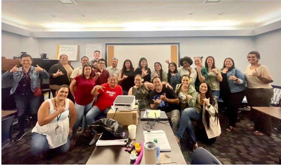
East Hawai'i CWS Workforce Training