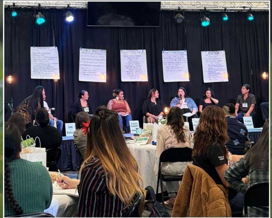
East Hawaii Pilina Circle Convening

The purpose to host a mock Pilina Circle to collect valuable input from stakeholders & Lex, strengthen relationships, and aligning on engaging young people in their case plan.